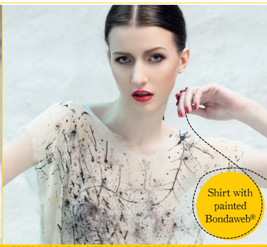
BONDAWEB® T6, T10, T25

VLIESOFIX® WIDTH: 30 cm, 90 cm, Display 45 cm // PRE-PACK: 17 cm x 1 m