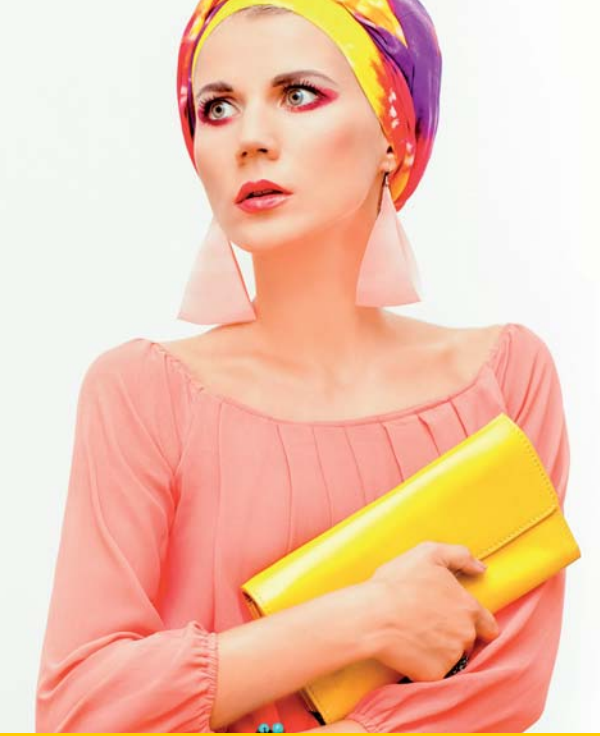
WE RECOMMEND PERFORMING APPLICATION TESTS BEFORE PROCESSING THE PRODUCT.