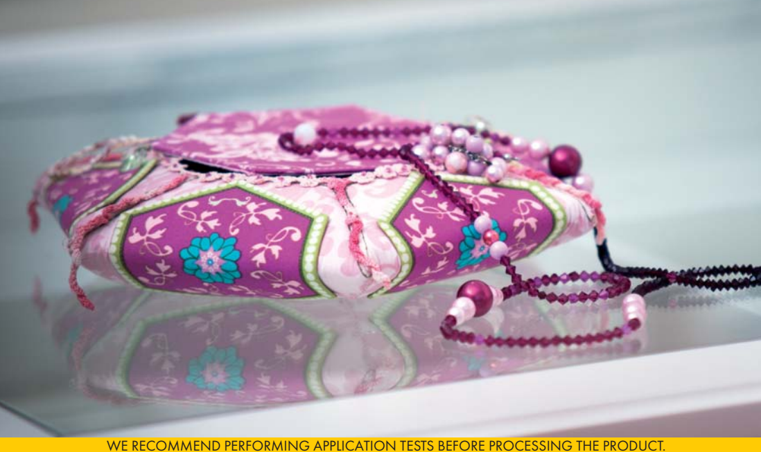
WE RECOMMEND PERFORMING APPLICATION TESTS BEFORE PROCESSING THE PRODUCT